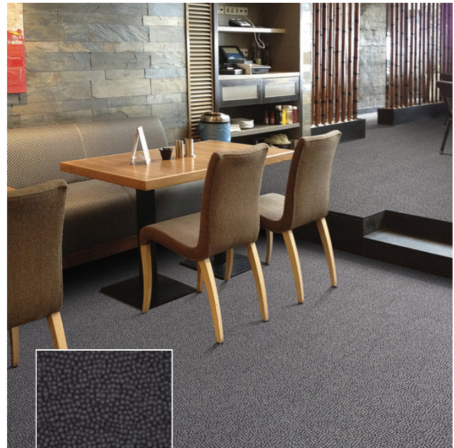
810 / Zen Design Mosaic / Charcoal